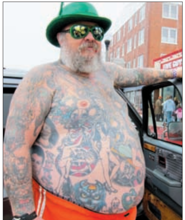
AND FOR SOME , the Polar Plunge offers an opportunity to show off their own personal expressions of art.