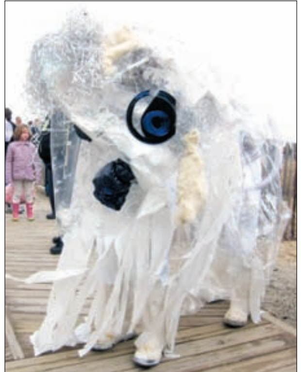
POLAR PLUNGERS GET VERY creative with the costumes they wear to celebrate the annual dip.

• A nor'easter caused the Plunge to be postponed until March in 1996 and 2010