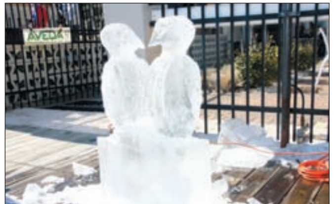
THIS PAIR OF LOVEBIRDS is another of the ice sculptures created at one of the recent Polar Plunge events.