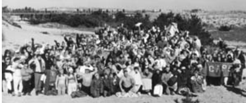
THIS GROUP SHOT OF the Lewes Polar Bear Plunge in the mid-1990s shows the event when it was held at Cape Henlopen State Park in Lewes.

• In 1995 the weather turned frigid with zero-degree temperatures and winds gusting to wind chills of minus-25 degrees! A total of 339 bears braved those wicked winds!