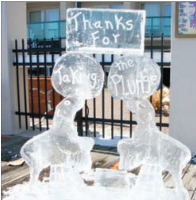
ICE SCULPTORS ALSO APPRECIATE what the Polar Plungers do for Delaware Special Olympics.